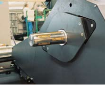
Standard quick changeover 3" and 6" (76 mm and 150 mm) core chucks ensure flexibility and production safety