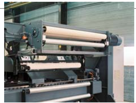
The splice arm was redesigned to minimize the distance between splice roller and splice knife to increase splice efficiency to over 99.5%