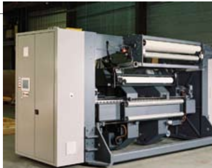
Key features include splicer turret with standard split arms, fully automatic quick changing chucks, 4 quadrant motors on each arm for drive and braking, pivoting splice arm and dancer assembly