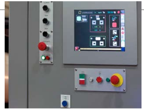
Control panel and WEBVIEW

Accurate alignment of the incoming roll to the running web prior to splicing is essential to eliminate overlapping edges, which is a significant cause of web breaks. On the DLC 5000 and DLC 6000, automatic roll alignment prior to splicing is standard.