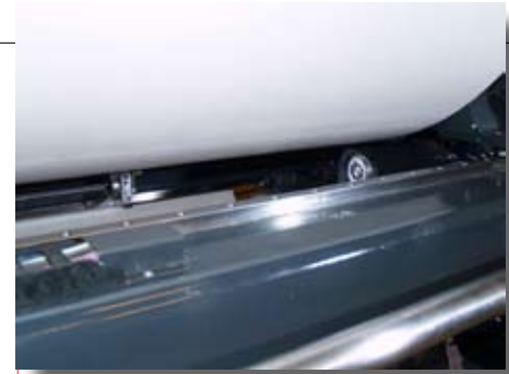
Unique mechanical transmission with spline shafts for high design modularity between 2-Quadrant and 4-Quadrant drive systems