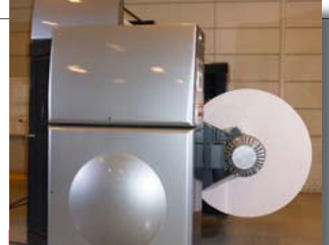
Compact, modern design and very low machine height to fit in all existing press basements

significant flexibility for running partial rolls without special handling. Normal and symmetric configurations are available for dual web center loading. On many MP models the ARL (Auto Roll Loading) option allows interface to the paster with an automatic roll loading system and to load new rolls and unload cores or butt rolls - 100% without operator assistance. The optional MEGTEC ROLLOAD® roll handling system provides all roll handling functions from roll preparation at a central unwrapping station to the paster and is available in different levels of automation. The benefits of operation include reduced paper waste, higher efficiency and enhanced safety.