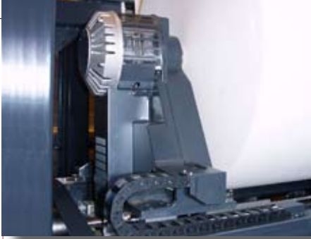
Motorized split arms are standard on all MP 12 – MP 24 models