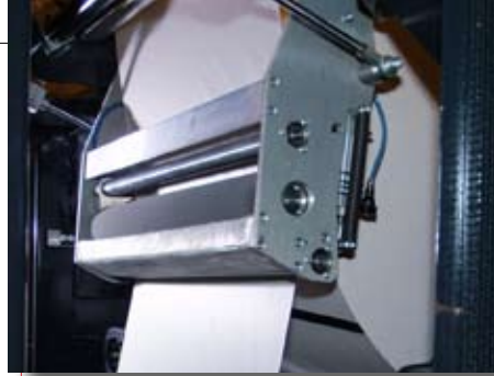
Many parts are identical or modular on all MP models with highest functionality at a low investment cost for the customer