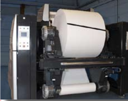
Core acceleration is standard on all MP models. This allows easy straight-across splice preparation